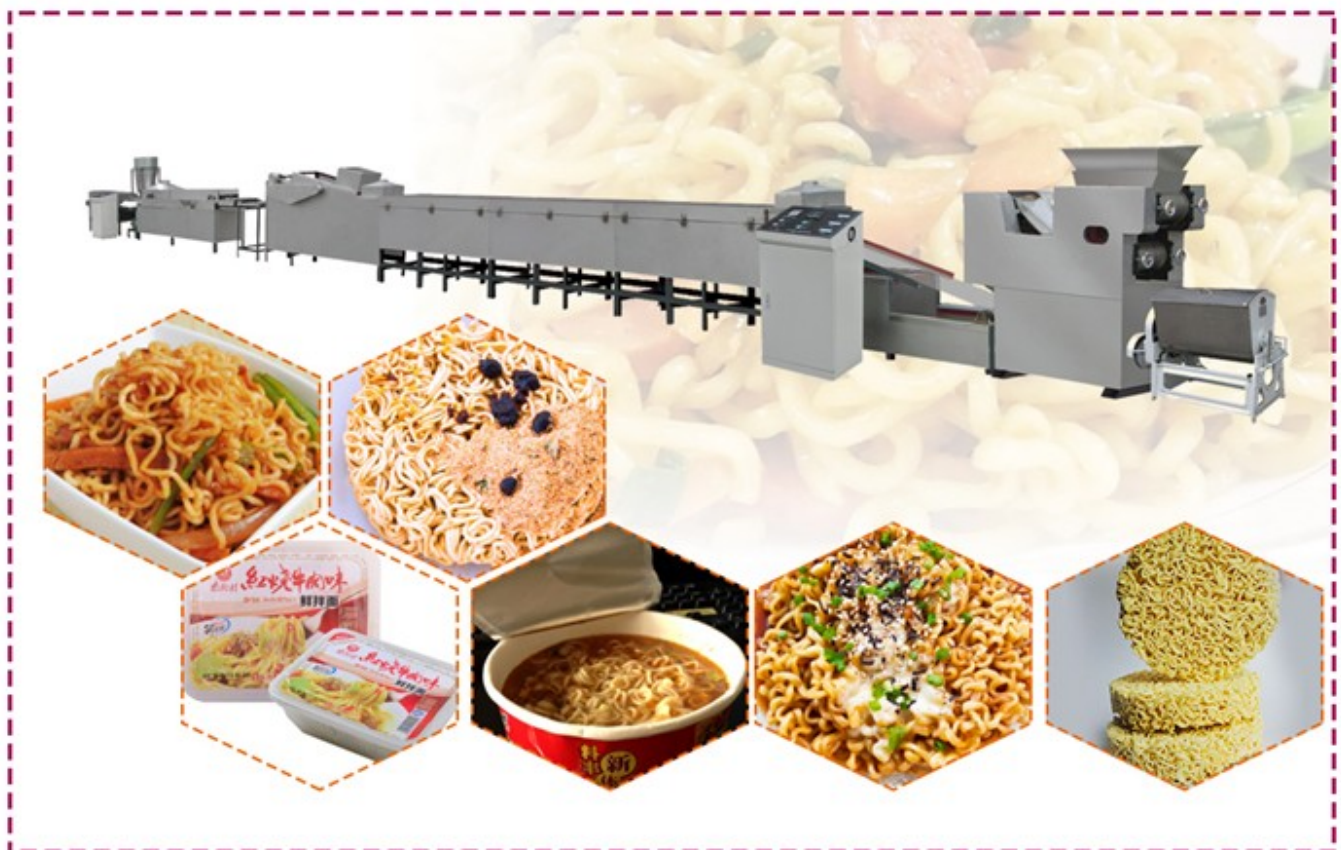
Commercial instant noodles making processing line

Automatic instant noodle production line was consisted of dough maker, forming host, steam noodle machine, cutting machine, frying machine and cooler. It is on the basis of the research of similar products at home and abroad, combined with the needs of the mass consumer market in China. With miniaturization the production features a new generation of products developed and manufactured by its technology to improve, compact design novel, stable and reliable performance. The automatic instant noodles production line from flour to finished product once complete, the high degree of automation, simple operation, moderate, production, energy saving, small footprint, the investment is only one tenth of the large-scale equipment, with less investment and quick. Special suitable for small and medium-sized enterprises.