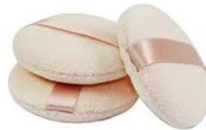
Powder puff microwave drying equipment

The powder puff microwave dryer has advanced technology and can be equipped with assembly line production with superior performance. In addition, because microwave drying does not need to provide a heat source, only the puff sponge is heated and dried, so the equipment has no thermal inertia and can be turned on and off immediately. The operation is simple and convenient, which greatly saves labor.