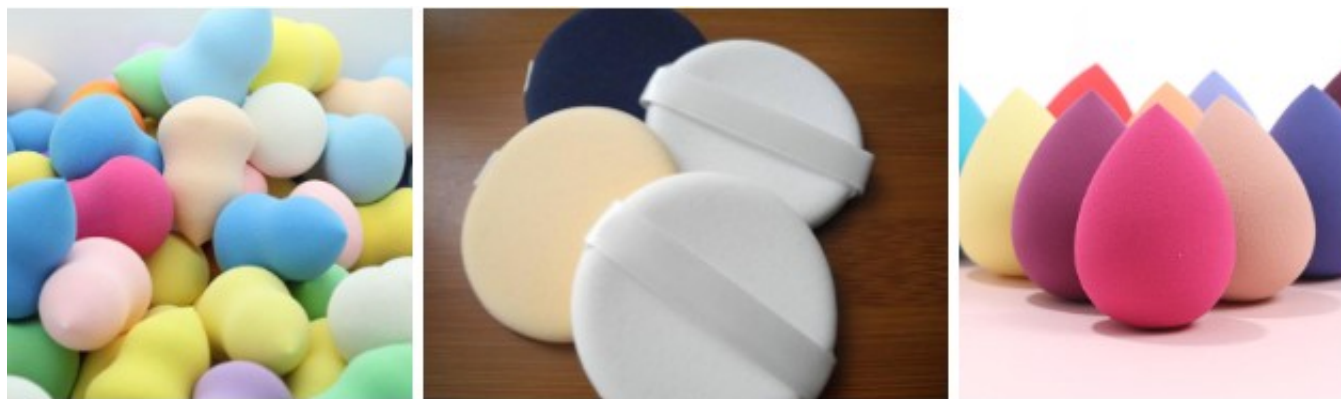
Powder puff sample

regardless of the shape of the object, since the inside and outside of the object are heated at the same time, the temperature difference between the inside and outside of the material is small, and the heating is uniform. It will not produce the condition of external coke endogenesis during conventional heating, which greatly improves the drying quality.