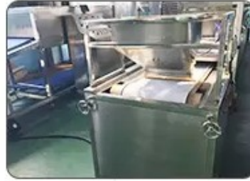
2. Feeder : Customizable according to your materials