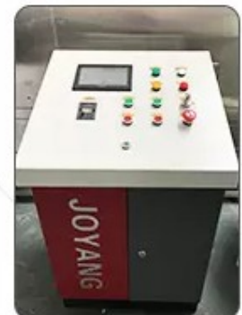
4. Control cabinet: Add a control box, neat and easy to clean.