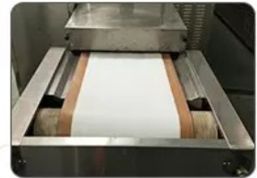
3. Belt: Customizable mesh belts of various materials