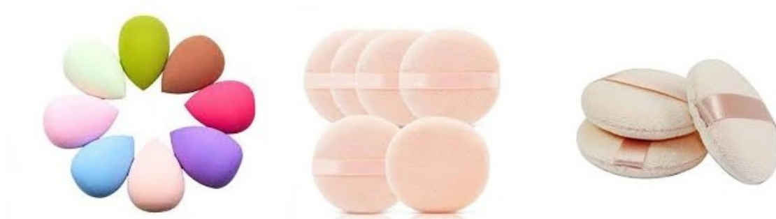
Powder puff microwave drying equipment

The powder puff microwave dryer has advanced technology and can be equipped with assembly line production with superior performance. In addition, because microwave drying does not need to provide a heat source, only the puff sponge is heated and dried, so the equipment has no thermal inertia and can be turned on and off immediately. The operation is simple and convenient, which greatly saves labor.