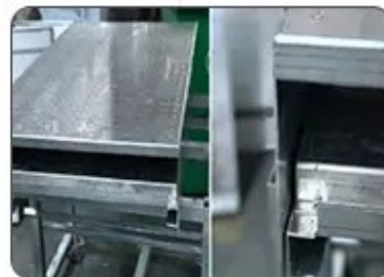
5. Microwave limiter: Prevent microwave leakage