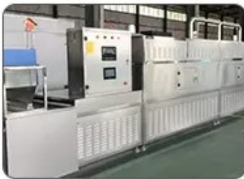
6. Material : 304 stainless steel