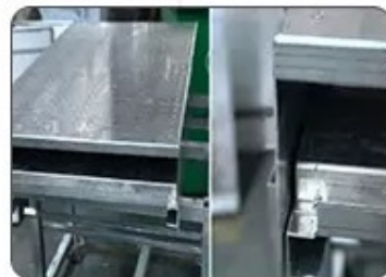
5. Microwave limiter: Prevent microwave leakage