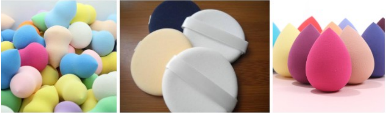
Powder puff sample

regardless of the shape of the object, since the inside and outside of the object are heated at the same time, the temperature difference between the inside and outside of the material is small, and the heating is uniform. It will not produce the condition of external coke endogenesis during conventional heating, which greatly improves the drying quality.