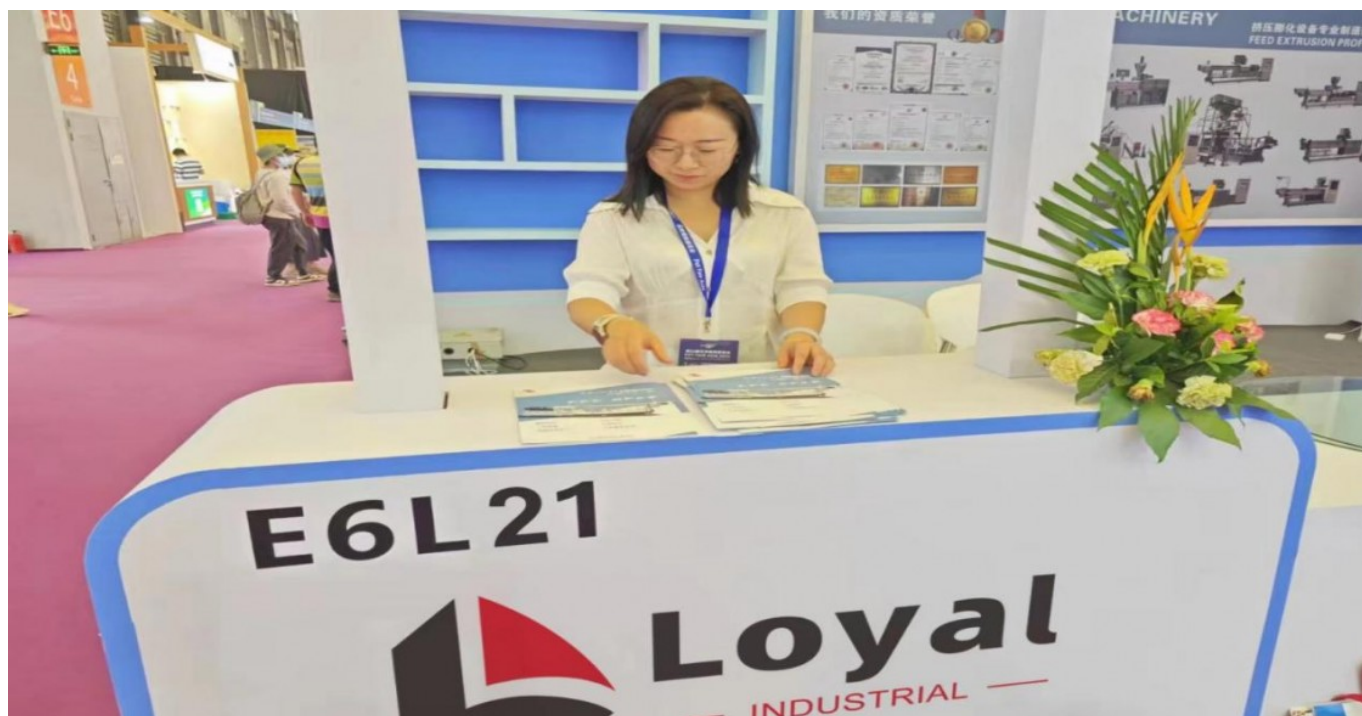
Company Booth Display