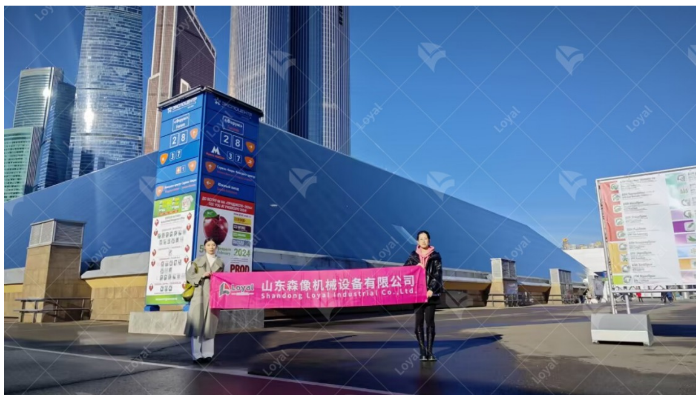
Photo 1 Group photo of Loyal staff at the exhibition

Celebrating Shandong Loyal Industrial Co., Ltd's participation in the 2023 Russia Food Processing and Packing Equipment Exhibition ? This is an excellent opportunity to showcase the company's technology and products, communicate with industry players in Russia and abroad, and find new business opportunities.